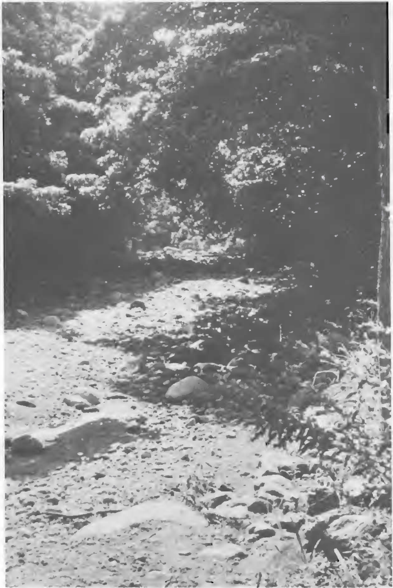
FIG. 1.—Gallery forest along the Belham River. Mist nets were set over the river at this location.